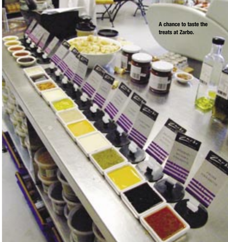
A chance to taste the treats at Zarbo.